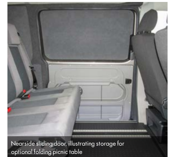
Nearside sliding door, illustrating storage for optional folding picnic table

(For illustration purposes only - not to scale).