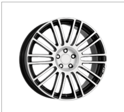
ALLOY WHEELS - OPTION 2 18" x 8.0" TÜV Approved. Load rated 945kg