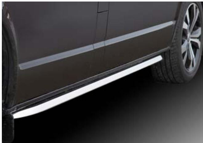
SIDE BARS Angled chrome styling bars