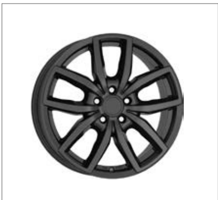
ALLOY WHEELS - OPTION 3 18" x 8.0" TÜV Approved. Load rated 945kg