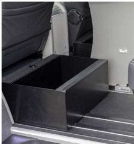
STORAGE BOX Fitted behind front seats