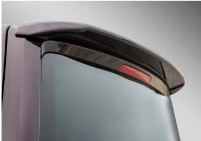
REAR SPOILER Available for tailgate or wing door