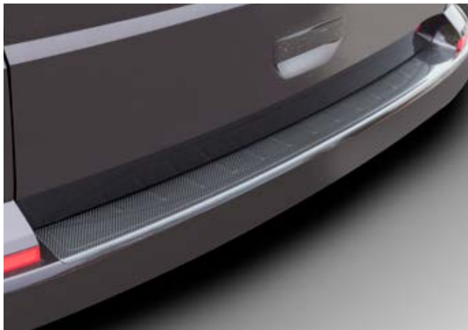
REAR BUMPER Moulded protector for upper surface