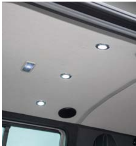
PASSENGER COMPARTMENT CEILING Trimmed headlining with LED lights and speakers

The Flexivan's stylish looks aren't restricted to the interior. You can specify the body colour of your choice from the manufacturers standard range. Enhancements such as 18" alloy wheels, with a wide choice of designs to suit most tastes, air suspension that elevates the ride to that of a luxury coach, allowing a choice