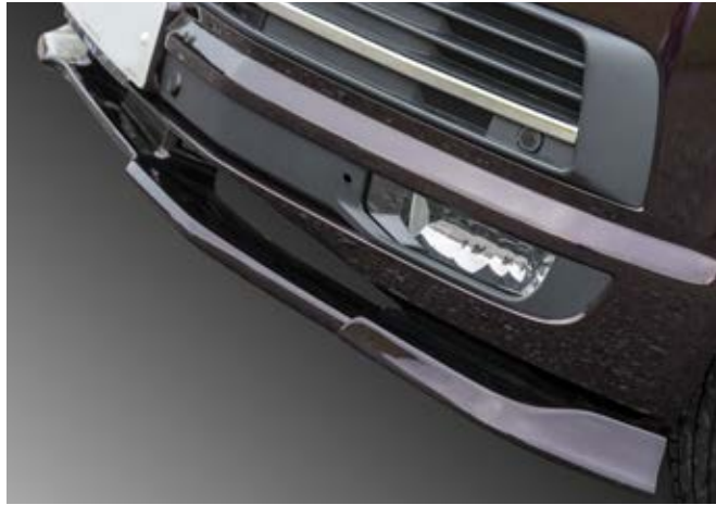
FRONT SPLITTER For that 'business' look