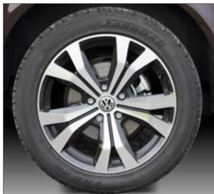
ALLOY WHEELS - OPTION 1 18" x 8.0" TÜV Approved. Load rated 930kg