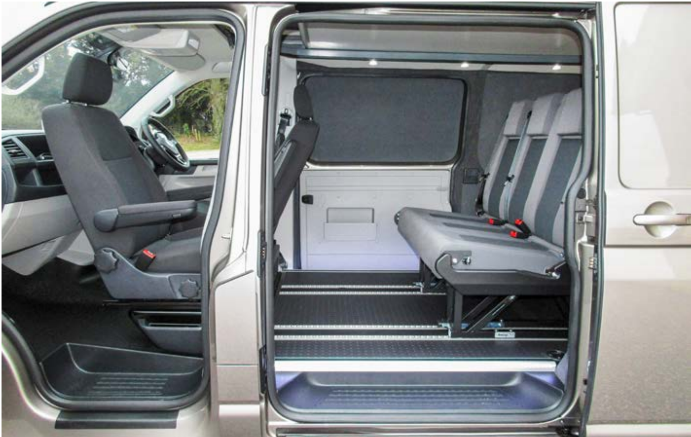
THE CLASSIC DAY VAN Illustrating the additional Tourer removable rock n roll seat bed with front passenger seat fitted with optional swivel

Tourer rock n roll seat bed folded flat to form a comfortable bed