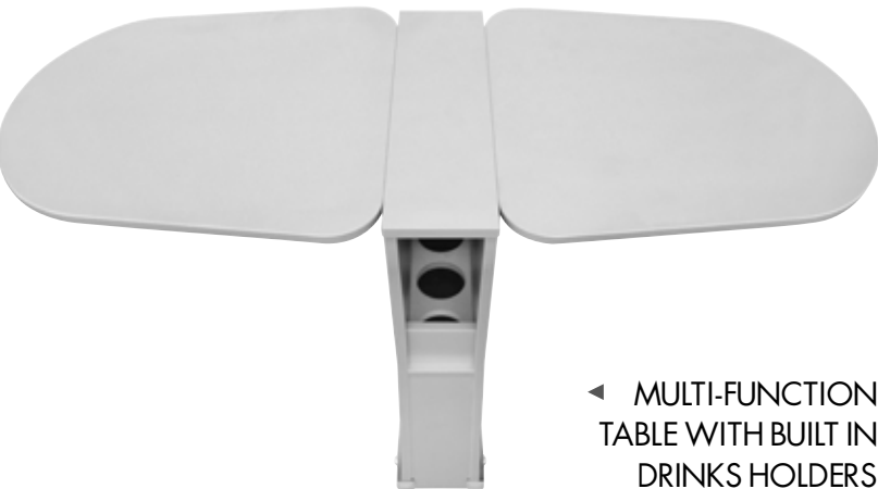
◀ MULTI-FUNCTION TABLE WITH BUILT IN DRINKS HOLDERS