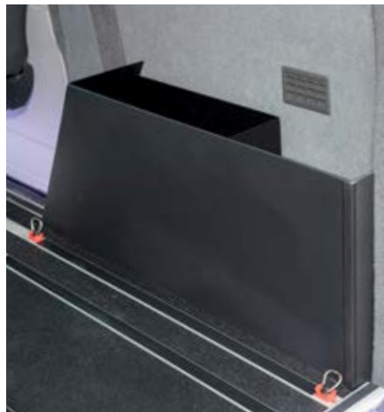
STORAGE CONTAINER TO LUGGAGE AREA Fitted over wheelarches to create additional storage